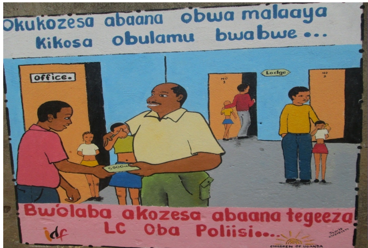
Painted at Mutukula Boarder Market