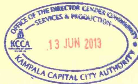
For: Executive Director